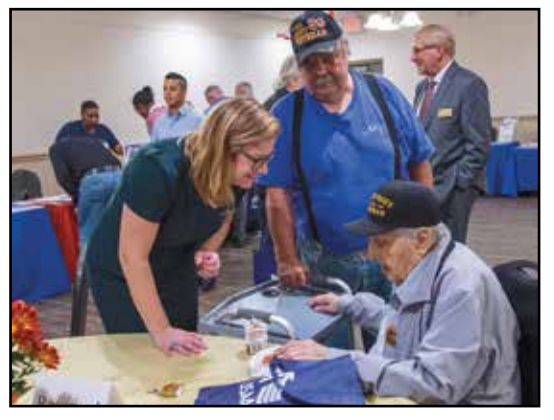
It is always a privilege to honor local veterans at my annual Veterans Lunch!